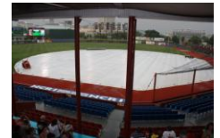
Waiting for the rain to stop