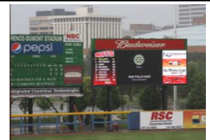
The billboard says "End Polio Now"