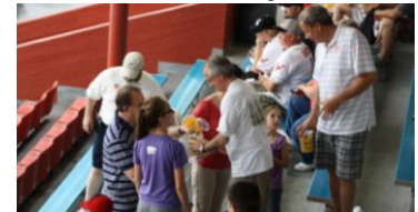
Our members collecting for Polio Plus